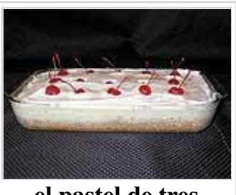
el pastel de tres leches – the three cream cake