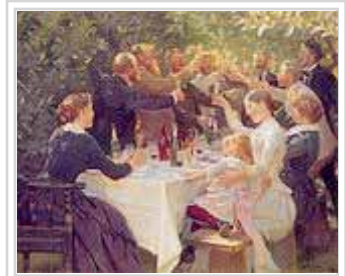
brindar – to toast