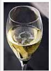
la copa – the drink