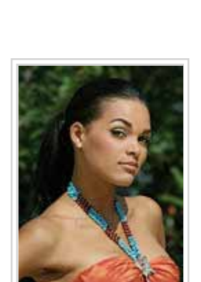
la señorita the miss