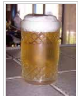
la cerveza – the beer